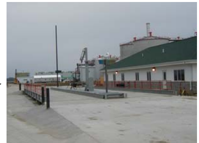
Administration building and Scales

If you sell committed bushels to the plant through a grain broker, your freight allowance and price paid per bushel will be included in one check. The amounts will be separated on the grain settlement statement; however, you will be responsible for separating the check between you and your broker.